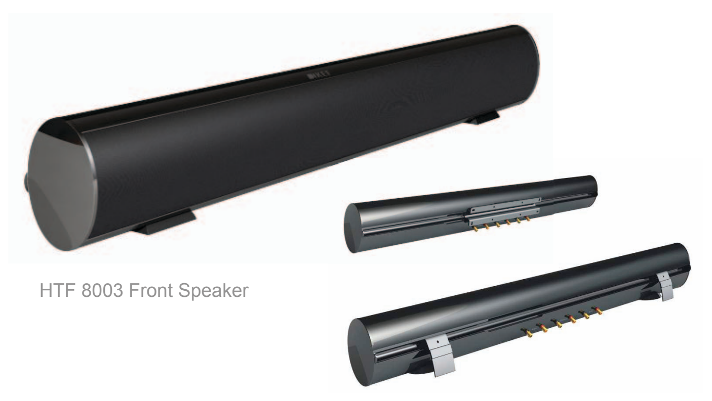
HTF 8003 Front Speaker – rear view